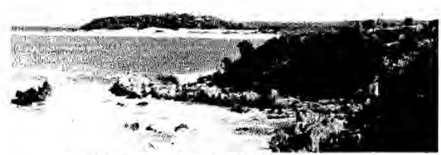
Broulee from Mossy Point - The vicinity of the last hours of the Rover

"Wait! Joseph. You're too small. You can't help that way and I can't swim."